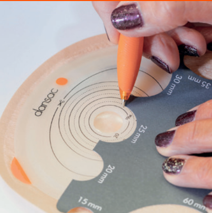
After you have measured your stoma, use the stoma guide or template to transfer the size and shape of your stoma onto the cutting guide of the adhesive barrier.