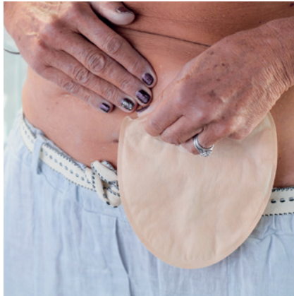
Gently remove the pouch, tighten the skin on your abdomen by pressing it with one hand, while you carefully remove the adhesive barrier. Once removed clean with warm water and thoroughly dry the skin around the stoma.