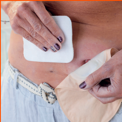
It may be useful to use some damp cloths to moisten the edges of the barrier.