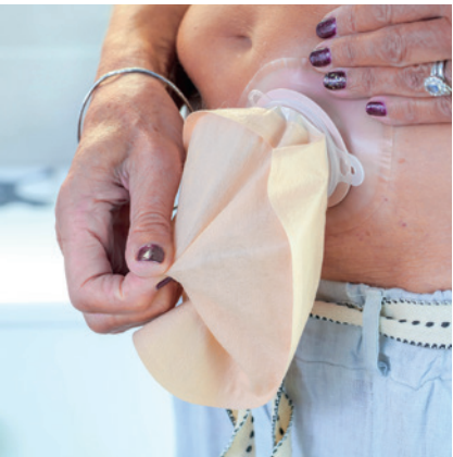
Double check that the pouch is securely connected to the barrier ring by gently pulling at the pouch.