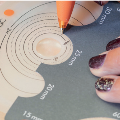
After you have measured your stoma, use the stoma guide or template to transfer the size and shape of your stoma onto the cutting guide of the adhesive skin barrier.