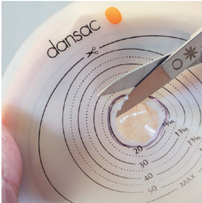
Adjust the starter hole with small, sharp scissors taking care to follow the outside edge of the marking. Make sure the hole fits snugly to your stoma. Cut the barrier as measured by the stoma guide.