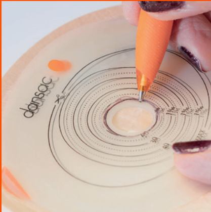
Cut the barrier as measured by the stoma guide.