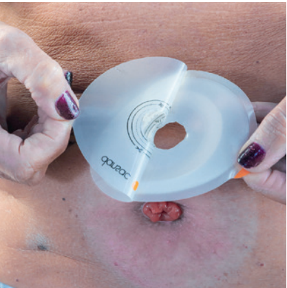
To apply the new skin barrier, remove the protective covering of the adhesive barrier immediately before application.