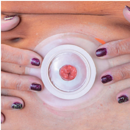
Position the adhesive barrier over your stoma. Press the barrier with your fingers from the centre to the edge to ensure it fits snugly and securely.