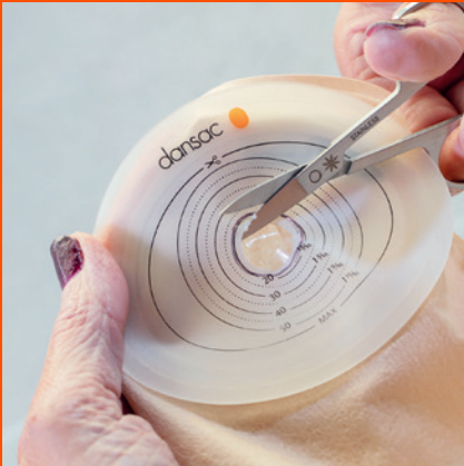
Adjust the starter hole with small scissors taking care to follow the outside edge of the marking.